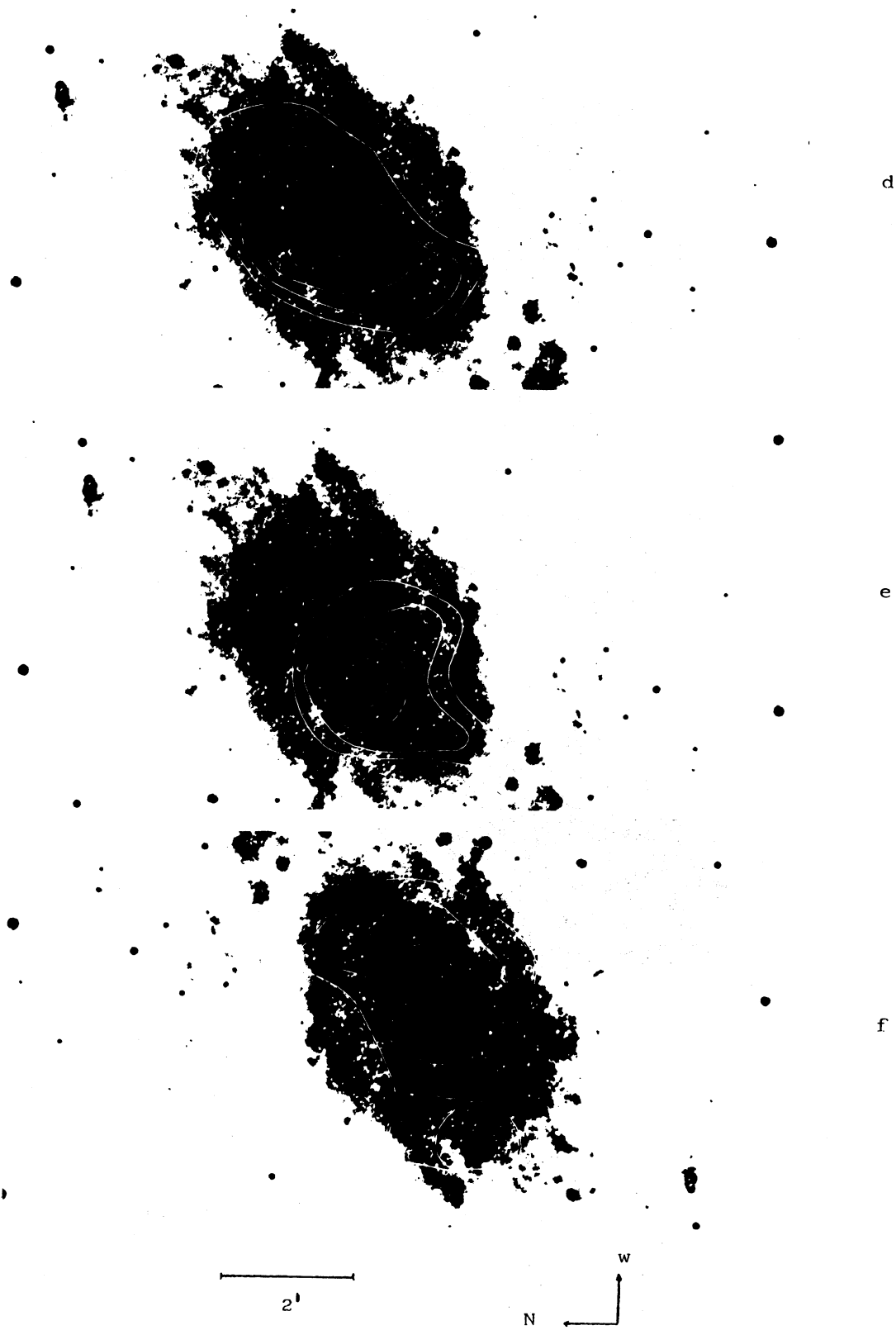
Fig. 2. Map of NGC 2403 (continued).