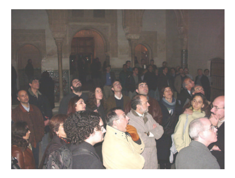
Visiting the Alhambra by night.