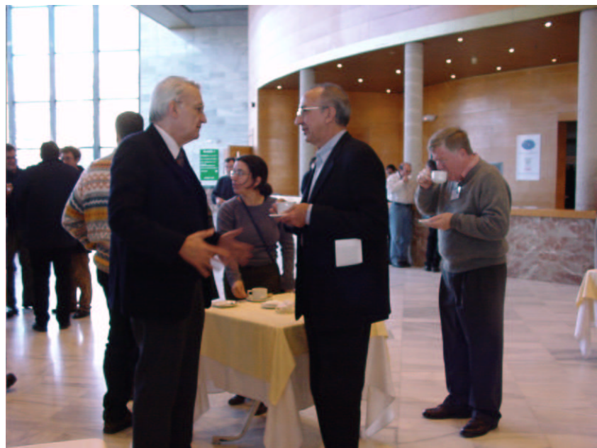
Top: View of the conference hall. Bottom: A moment of relaxation between working sessions.