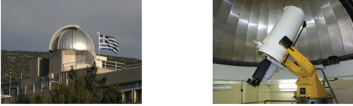
Fig. 1. The University of Athens Observatory with telescope and instruments inside the 5-m dome.