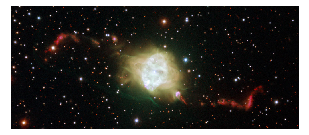
Figure 2. The PN Fg 1 shown by Boffin et al. (2012) to host a binary central star, which was responsible for launching the spectacular episodic jets before to entering the CE phase.

are younger than the nebula, indicating that the mass transfer/accretion episode that let to their formation occurred after the CE was ejected. While some theories of the CE do allow for continued accretion after its ejection, the jets are perhaps more likely the result of post-CE infall or even accretion from the secondary back onto the primary. The latter is an intriguing possibility as many of the WD-MS post-CE systems seen in PNe are found to show inflated secondaries (inflated with respect to their expected MS radii), possibly a consequence of the accretion episode prior to the formation of (or even during) the CE phase. It might therefore be possible that the secondary of NGC 6337 exited the CE highly inflated, and shortly after proceeded to transfer matter back onto the primary leading to the formation of the jets. Whatever the true origin of the jets, the system surely warrants further investigation.