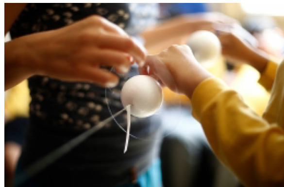
Fig. 1. Solar System tactile model, being explored by a visually impaired student during the first inclusive astronomical experience we created, in 2016.

The tools we used to meet this challenge were tactile models (Fig. 1), good storytelling, and lots of one to one interaction with the audience.